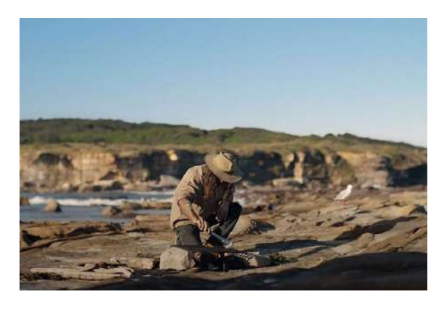
The advertisement highlights Indigenous experiences to a global audience.