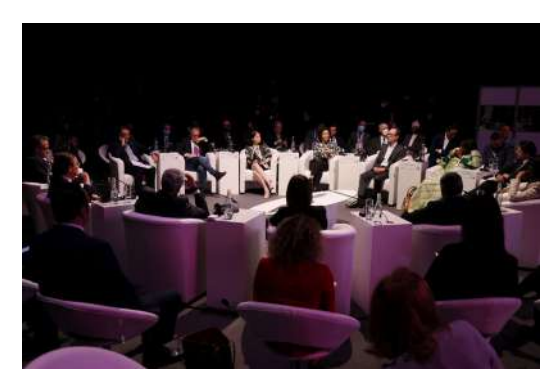
Tourism Secretary Bernadette Romulo Puyat (center) joins fellow tourism ministers in discussing the role of 'green investments' in sustainable tourism development at the recent tourism ministers' meeting at the World Travel Market in London.

The rehabilitation of Boracay Island, the vaccination of tourism workers, and promotion of low-impact activities were cited as initiatives by the Philippine government to ensure sustainable development of its tourism destinations at the recent summit of tourism ministers at the World Travel Market (WTM) 2021 in London.