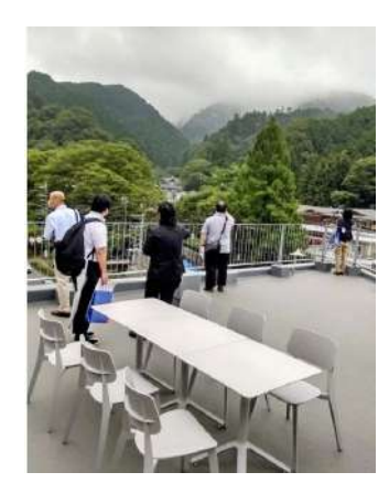
People observe the view from the rooftop terrace at a hotel opened by Keio Corp at the foot of Mt. Takao in Hachioji, Tokyo.

With the number of train passengers down as a result of many people refraining from traveling amid the pandemic, railway companies are stepping up their efforts to develop tourist spots within about one hour of central Tokyo.