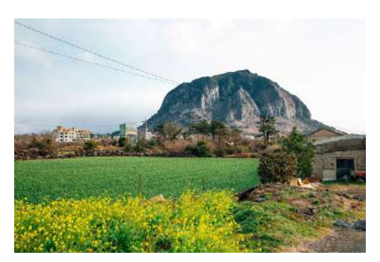
Mount Sanbang with yellow rape flowers on Jeju Island

Among tourist attractions in Seoul and nearby areas, the top-ranked locations for travel with pets included Seoul Land, an