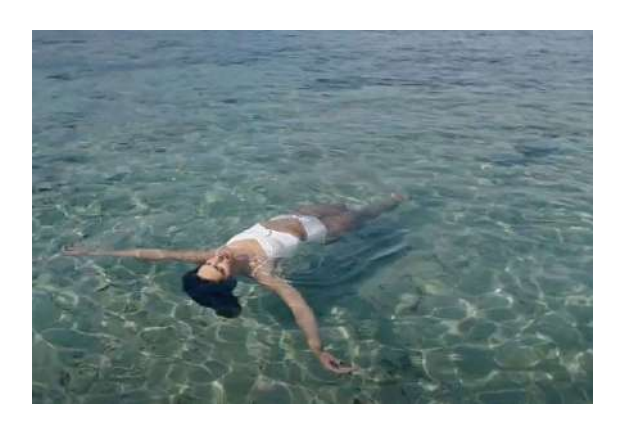
The advertisement highlights the state's natural beauties such as Mahon Ocean Pool at Maroubra.