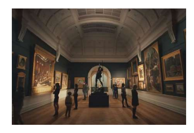
The ad uses a local cover of Nina Simone's classic 1965 song 'Feeling Good'.

The campaign is part of a recently announced $500 million tourism package that also includes $50 "Stay and Rediscover" accommodation vouchers.