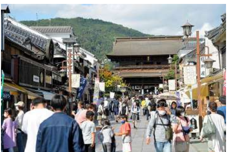
COVID-19 was fully lifted. (Kazuki Endo)

Such people will be exempted from restrictions on