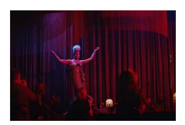
The campaign is the biggest of its kind in the last decade.

A $10 million tourism campaign has been launched by the New South Wales (NSW) government ahead of international travel restrictions easing in November 2021.