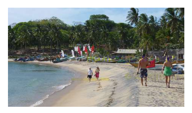
File photo - Tourists on the Southern coastline

Sri Lanka's tourism sector is equipping itself to safely re-enter the meetings, incentives, conferences and exhibitions (MICE) market as the country opens for tourism amid a Coronavirus pandemic.