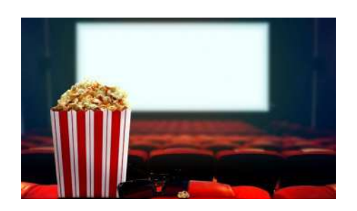
Representative image.

Several destinations where domestic and international popular cinemas have been shot have gained in terms of tourist influx, and cinema has in recent years emerged as a powerful tool for the development and promotion of destinations. Recognising the potential of films in promoting tourism, the symposium saught to reach out to the tourism industry in terms of the opportunities available in the states for conducting film shootings.