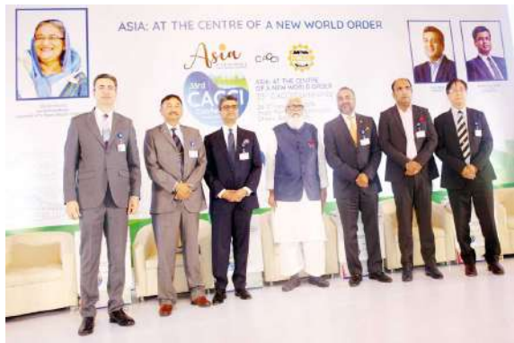
33<sup>rd</sup> CACCI CONFERENCE