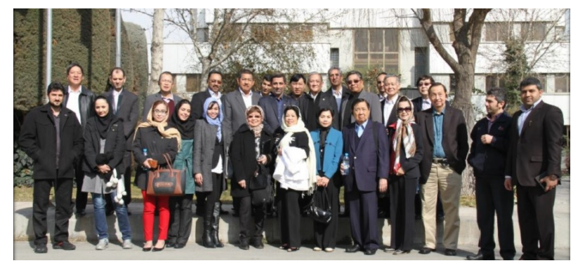
Members of the CACCI delegation pose for a group photo with officers of Mapna Group at the end of their tour of the Group's various manufacturing plants.