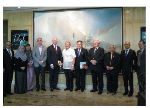
CACCI delegates meet with Brunei Banks Association officers after lunch.