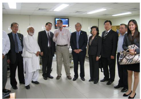
The CACCI delegation visit Pakistan Expo 2012