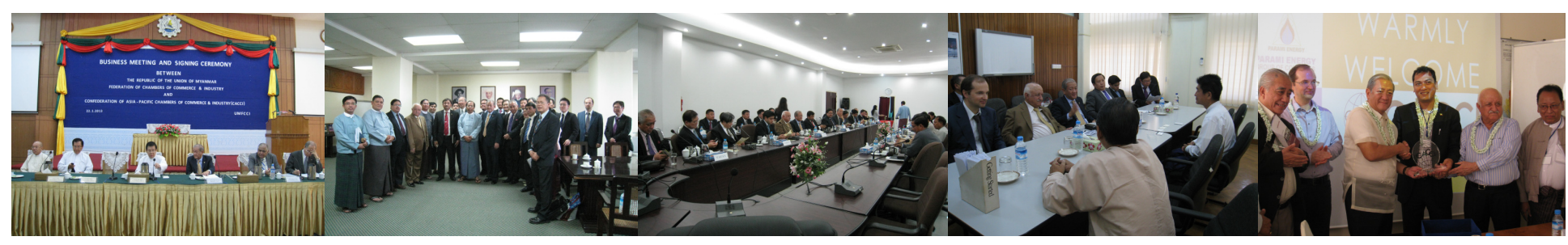
Meetina at UMFCCI

The three-day program enabled the CACCI delegation to meet with key officers and members of the following organizations to explore possible business opportunities and joint ventures: Union of Myanmar Federation of Chambers of Commerce and Industry; Central Bank of Myanmar; Myanmar Banks Association; Myanmar Securities Exchange Centre Co. Ltd.; Ayeyarwady Bank; Fame Pharmaceuticals Industry Co. Ltd.; United Wood Industry Co. Ltd.; Parami Energy Group of Companies; and Yoma Strategic Holdings Inc.