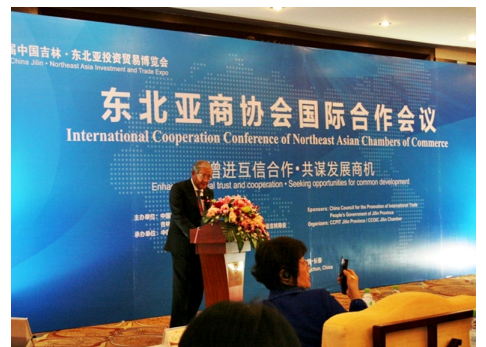
International Cooperation Conference