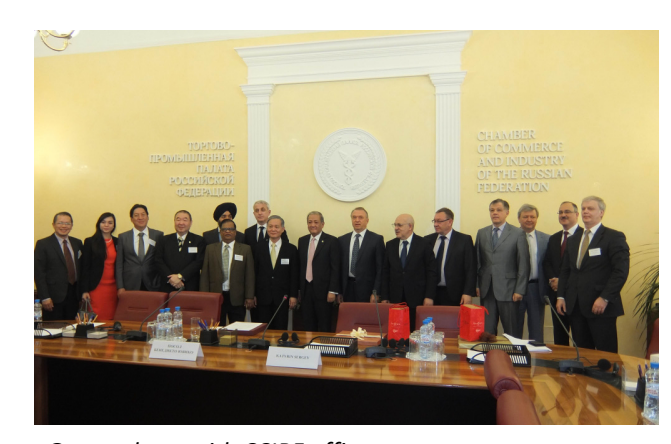
Group photo with CCIRF officers.