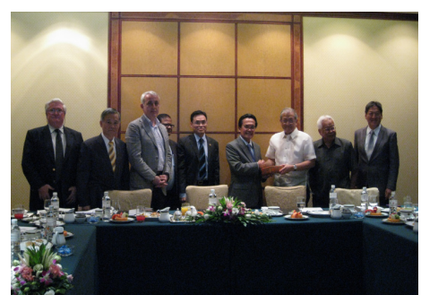
CACCI visitors learn about investment activities of the Brunei Investment Agency.