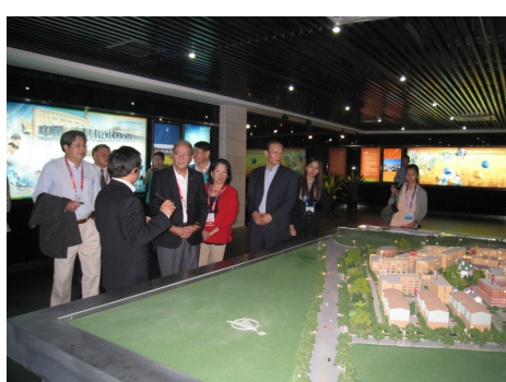
Changchun National Hi-Tech Industrial Development Zone