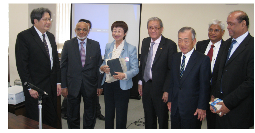
Sendai City Mayor Okuyama accepts tokens of appreciation from the delegation.